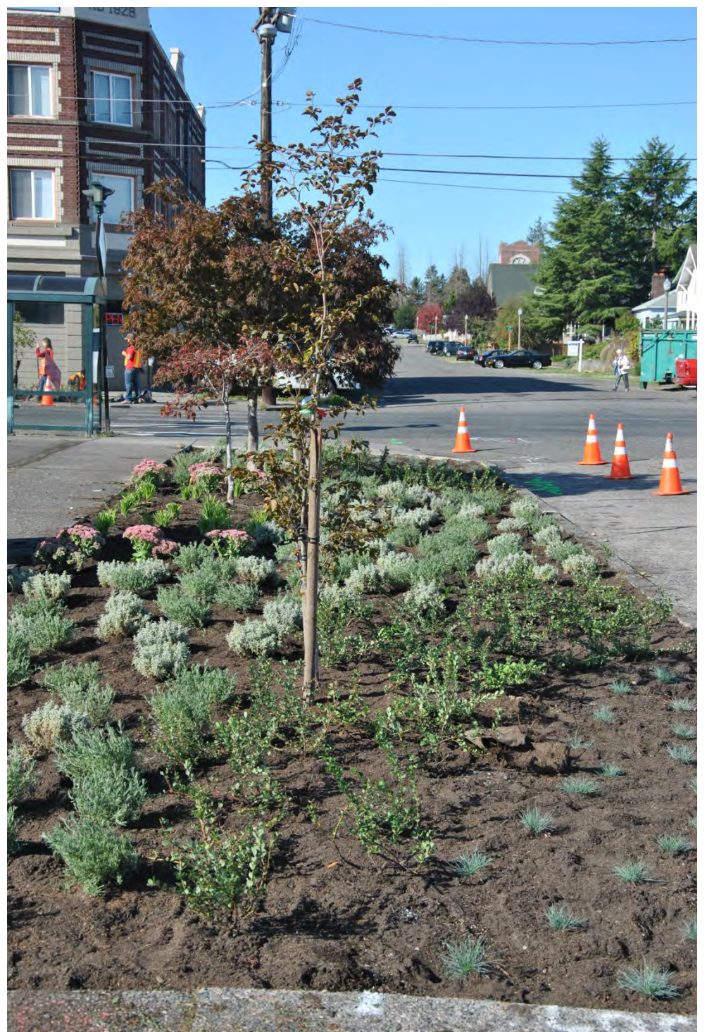
35TH STREET BEFORE AND AFTER